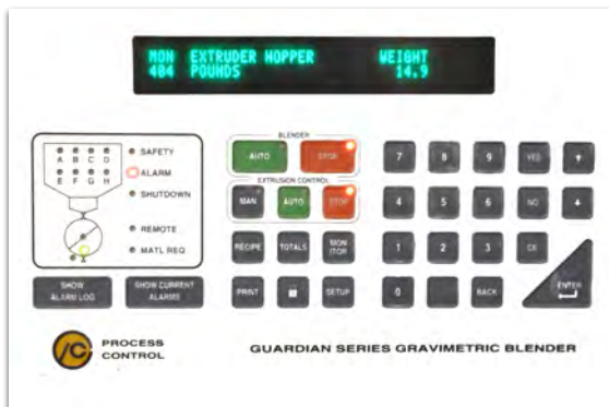
Old Operator Interface