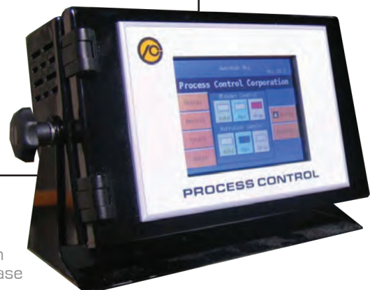
Guardian Color Touch Screen with Rotating Base